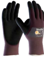
MaxiDry® MaxiDry® Elite