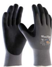
MaxiFlex® Ultimate™ MaxiFlex® Endurance™ MaxiFlex® Elite™